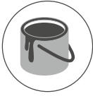
Choice of Colours